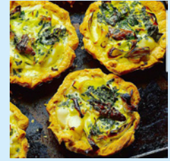
•4• Marinated mussels tart Preservation: salt 4%