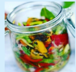
•8• Mussels with pickled vegetables Preservation: vinegar 10%