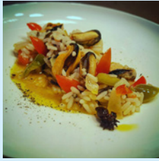
•1• Mussels with rice Preservation: salt 10%