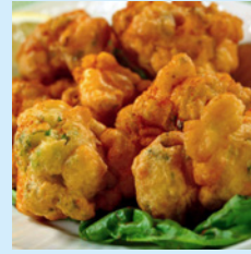
•3• Battered mussels Preservation: salt 10%