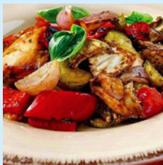
•9• Greek mixed roasted vegetables "briam" with mussels Preservation: salt 4%