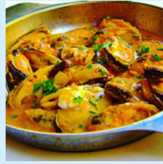
•2• Mussels saganaki Preservation: salt 4%