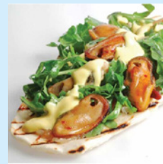
•7• Green salad with mussels and garlic sauce Preservation: vinegar 10%