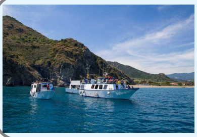
Pesca-tourism in Sicily