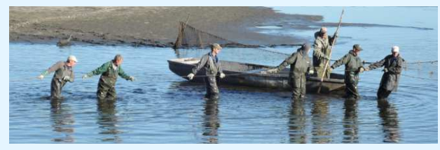
Barycz Valley in Poland, a traditional area of carp aquaculture